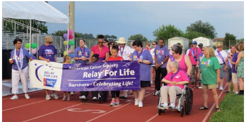
The Survivors & Caregivers Lap