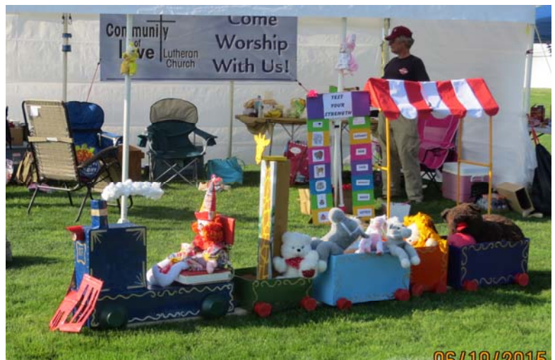
Our team tent site, featuring Karen's Circus Train.