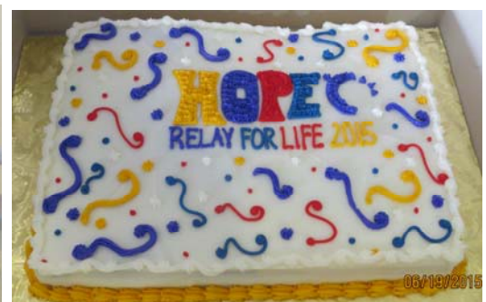
The donated gift baskets and cake for the Survivor's & Caregivers dinner.