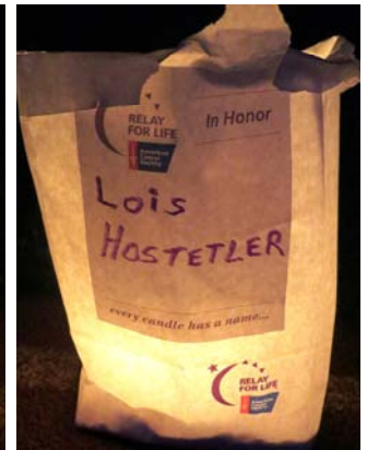
Bagpipers prep for the Luminaria Ceremony...just a few of the many Luminarias are shown here.